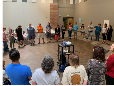
Weld Central HS staff gathers in a circle to practice one of the essential components of Advocacy!

There are currently more than a dozen Districts working together to implement SEL in their schools and the data around impact is strong. These districts are in the process of implementing an SEL structure, receiving planning and data support, professional development for staff and coaching for administration in the area of SEL along with free access to curriculum.