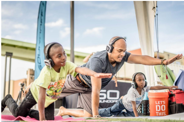
A yoga instructor teaches two young students.