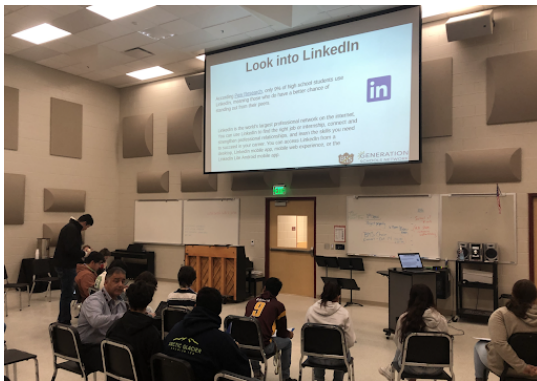
Students participate in a resume-building activity at Brush in Fall of 2021.