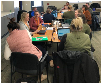
SSR reviewers analyzing data in teams.

Check the SSR dates on the S-CAP website , register and bring teachers with you. Teachers have said that attending an SSR is some of the most valuable PD they have ever experienced.