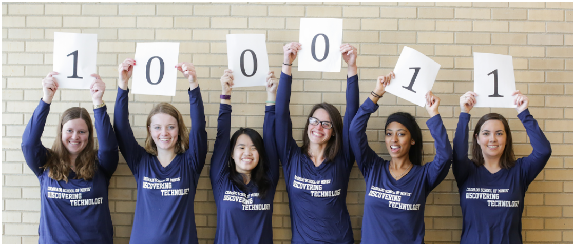
Female participants with numbers representing binary code. A binary code represents text, computer processor instructions, or any other data using a two-symbol system. The two-symbol system used is often "0" and "1" from the binary number system.

CSPdWeek is back and will return to the Colorado School of Mines the week of July 19th-24th. This week-long professional development experience is directed towards computer science educators. The following programs are available, and all support teachers in offering inclusive and rigorous computer science learning opportunities: Bootstrap (Algebra, Data Science, Reactive or Physics), Exploring Computer Science, Beauty and Joy of Computing, Counselors 4 Computing. Scholarships and housing are available. Find out more information here .