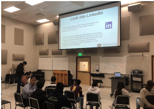
Students participate in a resume-building activity at Brush in Fall of 2021.