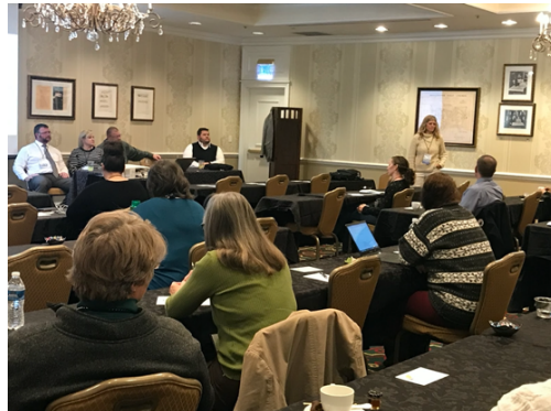
Attendees listen to a presentation at CASB.